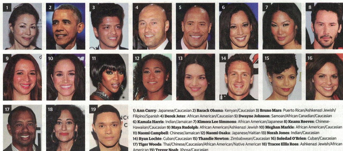
1) Ann Curry: Japanese/Caucasian 2) Barack Obama: Kenyan/Caucasian 3) Bruno Mars: Puerto Rican/Ashkenazi Jewish/Filipino/Spanish 4) Derek Jeter: African American/Caucasian 5) Dwayne Johnson: Samoan/African Canadian/Caucasian 6) Kamala Harris: Indian/Jamaican 7) Kimora Lee Simmons: African American/Japanese 8) Keanu Reeves: Chinese-Hawaiian/Caucasian 9) Maya Rudolph: African American/Ashkenazi Jewish 10) Meghan Markle: African American/Caucasian 11) Naomi Campbell: Chinese/Jamaican 12) Naomi Osaka: Japanese/Haitian 13) Norah Jones: Indian/Caucasian 14) Ryan Lochte: Cuban/Caucasian 15) Thandie Newton: Zimbabwean/Caucasian 16) Soledad O'Brien: Cuban/Caucasian 17) Tiger Woods: Thai/Chinese/Caucasian/African American/Native American 18) Tracee Ellis Ross: Ashkenazi Jewish/African American 19) Trevor Noah: Xhosa/Caucasian

People of Mixed Race Are Well Represented at the Top of Many Fields